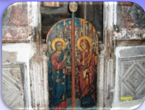
The holy gate